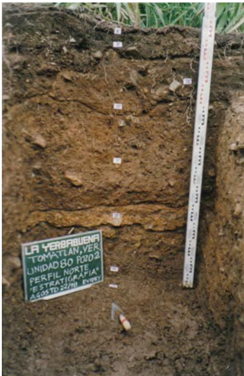
Figure 15. La Yerbabuena (Unit 80). Partial stratigraphy of the platform of Monument 1.

Seventy meters northwest of Pyramid 1, we found a second probable Olmec monument on the surface consisting of a small basin-like basalt sculpture ( Figure 16 , shown below, and Figure 17 ). This monument may have been in its original location on the surface because it is directly aligned with Monument 1 along the Northwest-Southeast axis of the ceremonial center.