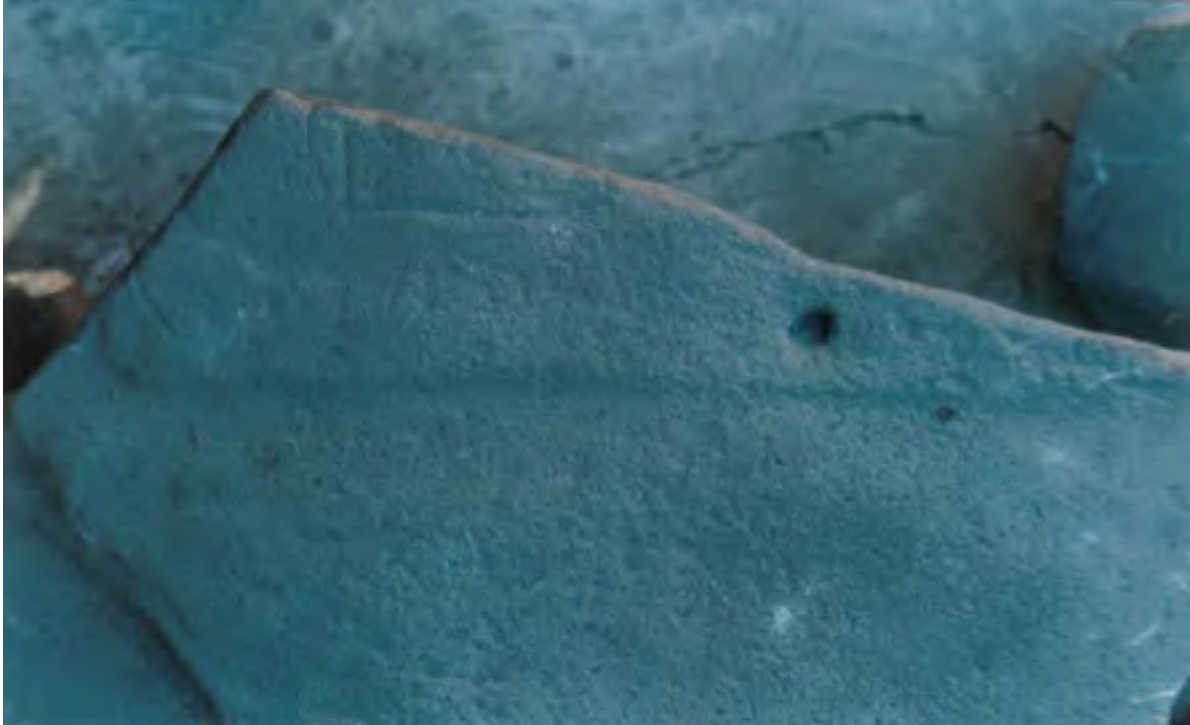
Figure 9. La Yerbabuena. Close-up of the sculpted section of the fragment shown in Figure 8. The main human figure in Monument 1 probably was shown standing on this sculpted band. The round hole in the center of the band probably was made by a looter's chisel.

The first day of work we recovered two fragments of the monument ( Figure 7 , Figure 8 , and Figure 9 , shown above). The most important fragment consisted of most of the monument's base which contains the sculpted band on top of which the main figure on the monument probably was standing.