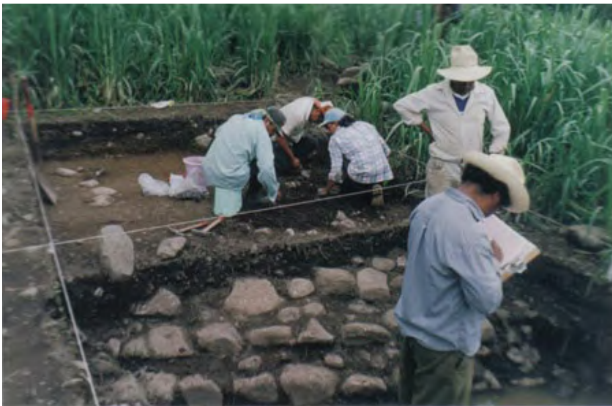
Figure 11. La Yerbabuena (Unit 80). Excavation of a stairway on the platform where Monument 1 was located. Probably Middle Formative.

Excavations in a pile of looters' rubble ( Figure 6 , shown above) and on the platform where the monument was located ( Figure 5 , shown above, and Figure 11 and Figure 12 , shown below) recovered several more probable fragments which have no surviving sculptured surfaces. So far, we have not located the sections having the lower torso and legs of the main sculptured figure. These fragments probably are buried less than one meter below the surface of Pyramid 1's platform which corresponds to Unit 80 in our project. None of the farmers at La Yerbabuena have seen these fragments since the field was transformed from maize to sugar cane cultivation in the early 1960s.