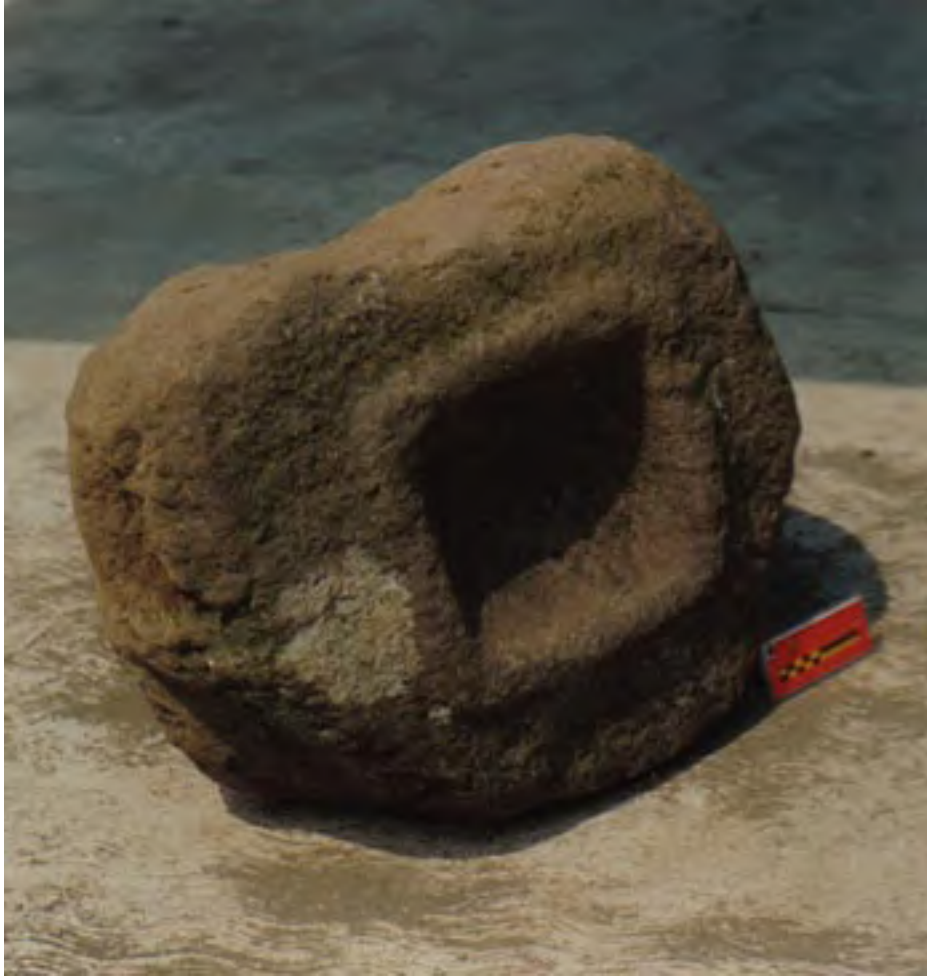
Figure 17. La Yerbabuena. Probable Olmec monument found on the surface 70 meters northwest of Pyramid 1.