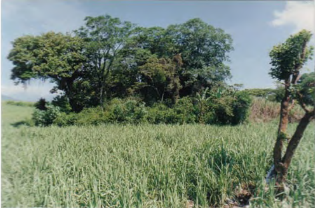
Figure 5. La Yerbabuena. Pyramid 1-looking northwest. The stela (Monument 1) was on a large platform approximately 2-5 meters west of the tree in the lower right hand corner of the photograph.