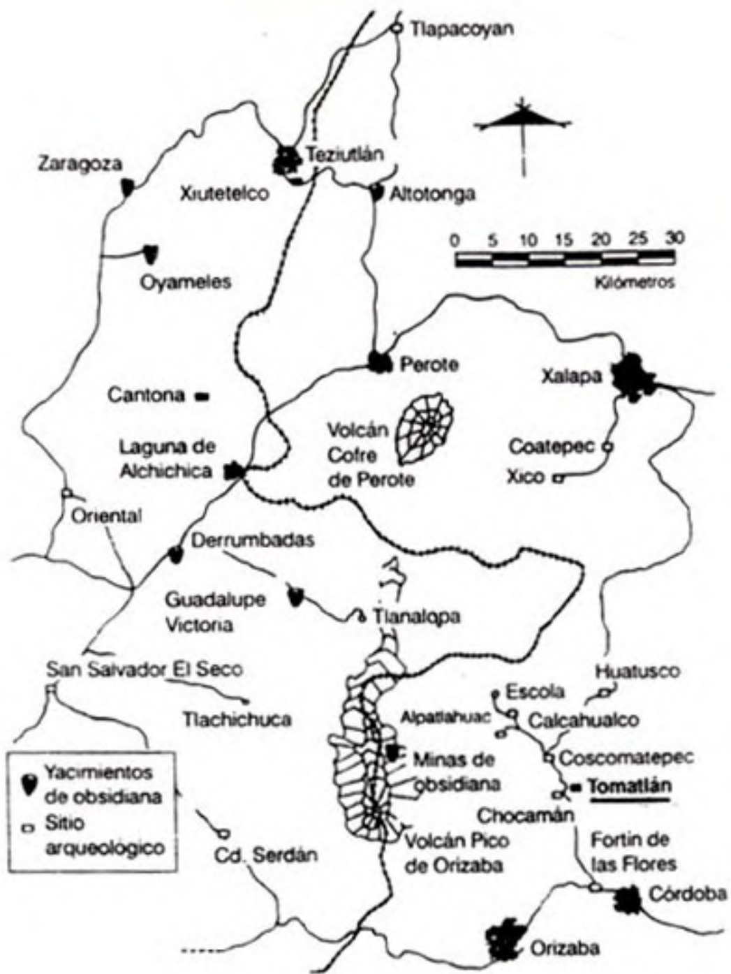
Figure 1. Map locating Tomatlán, Veracruz within the Pico de Orizaba Region.