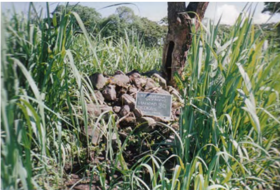
Figure 6. La Yerbabuena (Unit 80). Pile of looters' rubble on the west side of the tree in Figure 5. At least one probable fragment of Monument 1 was found in this rubble.