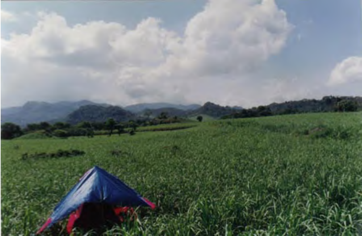
Figure 18. La Yerbabuena. General view of the main plaza looking southeast from the platform on the southern edge of Pyramid 1.