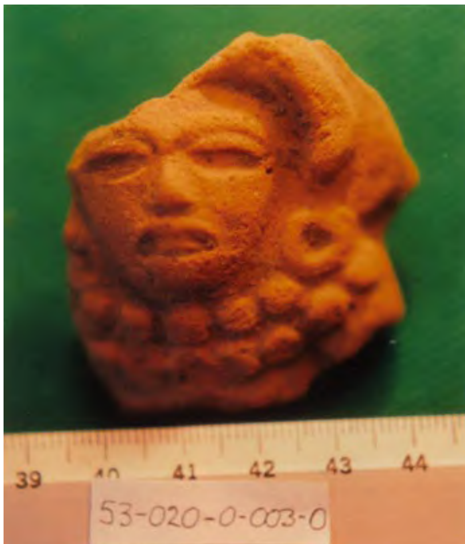
Figure 22. La Yerbabuena (Unit 53). Early Classic Teotihuacán style figurine found in a trash midden above the floors of a Late Formative house.

There appears to have been important Early Classic (circa 200-600 A.D.) occupations in some sectors on the peripheries of the main ceremonial precinct, but so far we have not identified Thin Orange or any other Teotihuacán-related ceramics except for one Teotihuacán-style figurine shown in Figure 22 .