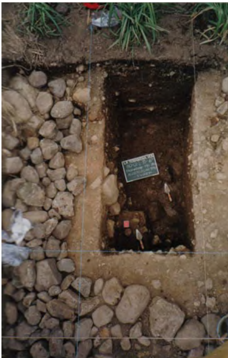
Figure 13. La Yerbabuena (Unit 80). Excavation in the platform where Monument 1 was located. An offering of a Middle Formative vase was found in the southeast corner of this excavation.

The ceramics of the excavations on the platform where the monument was located date this structure to the Middle Formative (probably between 800-600 B.C.) which corresponds to the probable date of the monument, given its stylistic similarities with the Olmec sculptures at La Venta, Tabasco. We found a well preserved stairway ( Figure 11 and Figure 12 ) at the edge of the platform associated with an offering of a complete Middle Formative vase ( Figure 13 , shown above, and Figure 14 , shown below).