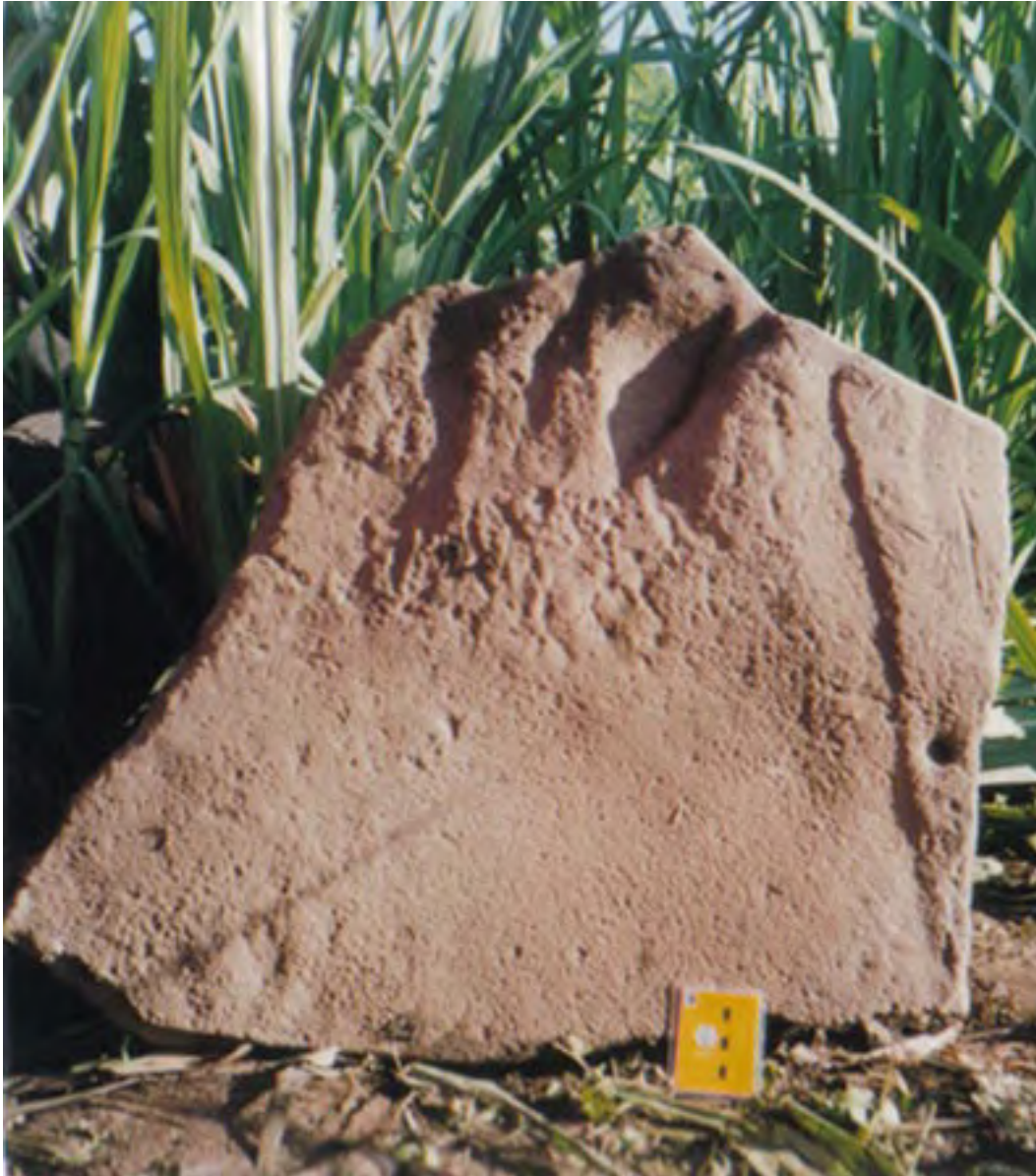
Figure 8. La Yerbabuena (Unit 80). Fragment of the base of Monument 1 found in a modern canal 22 meters southeast of the rubble pile where the other monument fragment (Figure 7) was recovered.