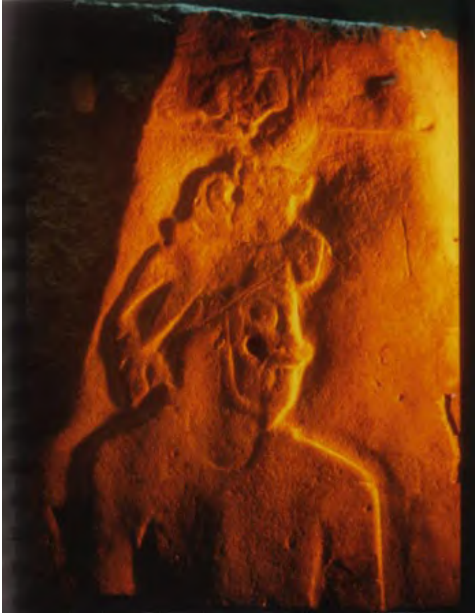
Figure 10. The original fragment of Monument 1 of La Yerbabuena which is now in the plaza of Tomatlán, Veracruz.