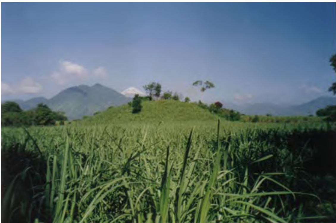
Figure 19. La Yerbabuena. (Units 70, 71, 74). View of Pyramid 2 and an area of obsidian workshops that was surveyed and excavated. Looking northwest.