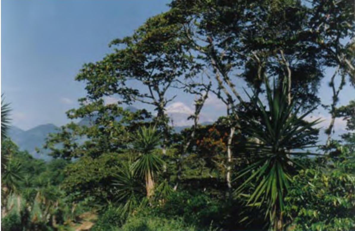
Figure 23. View of Pico de Orizaba Volcano from a forest with izote palms near a coffee plantation on the southern edge of La Yerbabuena.