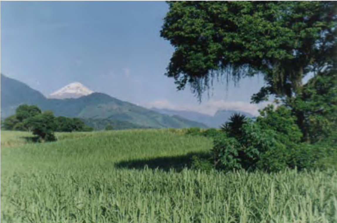
Figure 4. La Yerbabuena. View of Pico de Orizaba Volcano from the west side of Pyramid 1. Looking northwest.