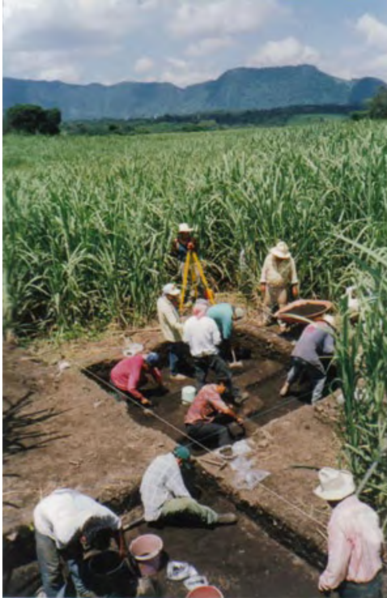
Figure 20. La Yerbabuena (Unit 91). Excavations on the eastern edge of a pyramid that was destroyed by farmers about ten years ago.

Most landowners at La Yerbabuena have been very cooperative with the goals of our project, and they along with the committee members of the Tomatlán, Veracruz Casa de Cultura seem to have scared off looters from the site. We have found only one new looters' pit at the site (on the west side of Pyramid 1) which apparently was dug about six months before we started fieldwork.