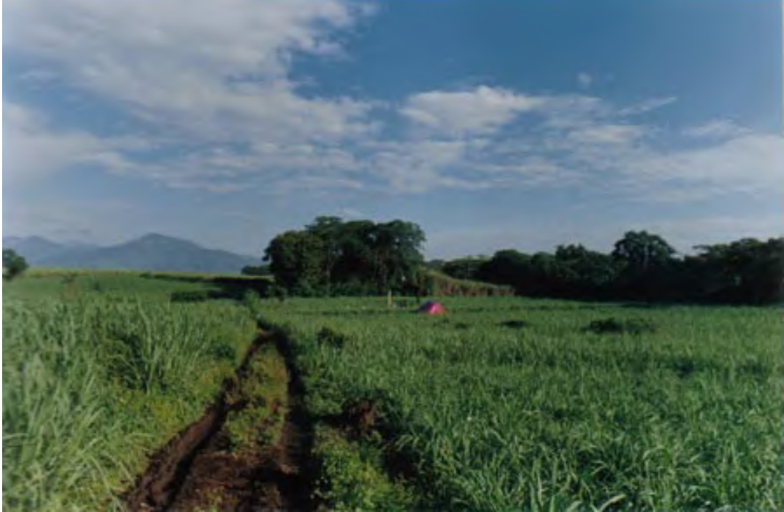
Figure 3. La Yerbabuena: View of main plaza and excavation locale (Unit 80) in front of Pyramid 1. Looking northwest.