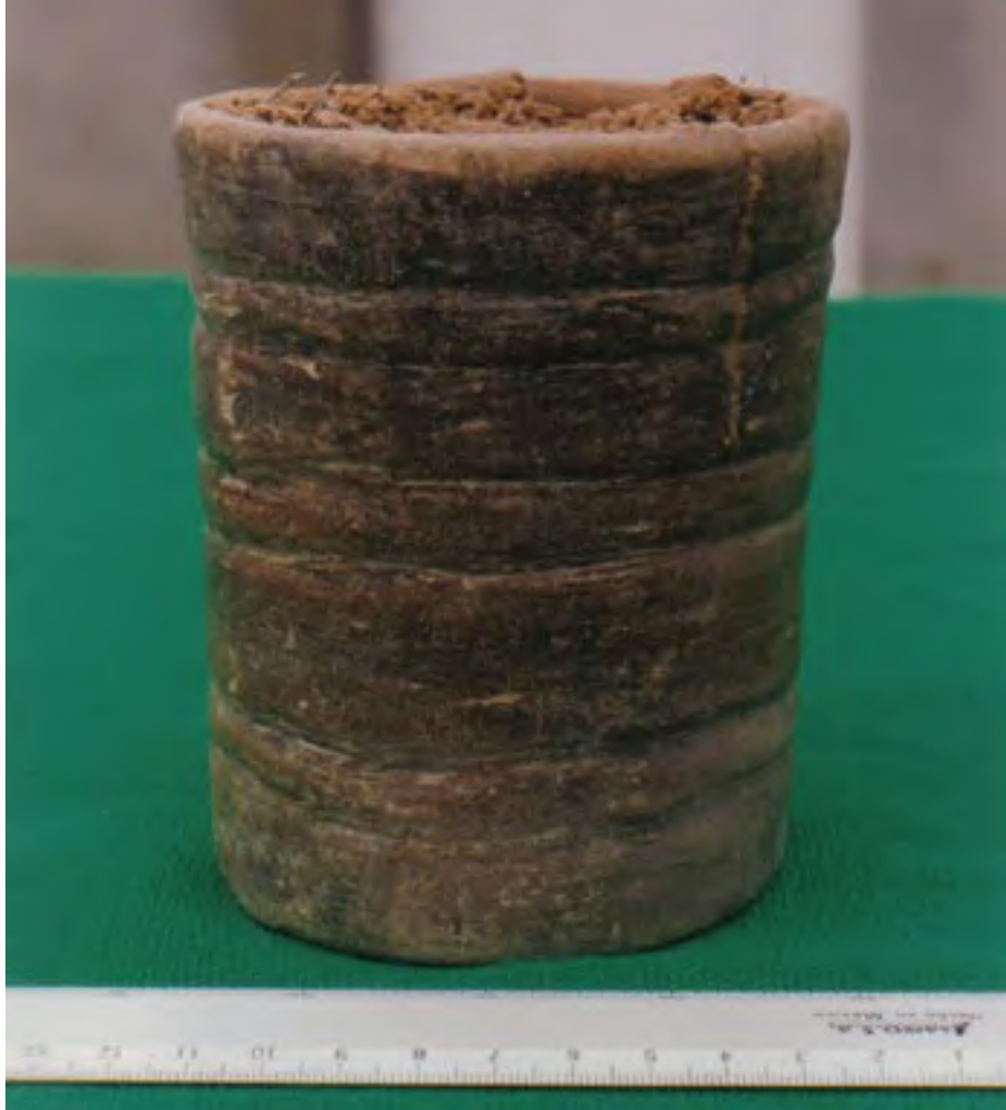
Figure 14. La Yerbabuena (Unit 80). Probable Middle Formative vase found as an offering in the platform of Monument 1.