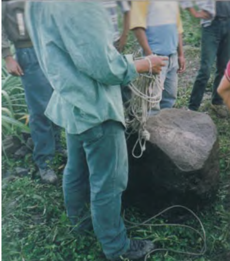
Figure 7. La Yerbabuena (Unit 80). Probable fragment of Monument 1 found in the pile of looters' rubble shown in Figure 6. This fragment had no surviving sculptured surfaces. It probably is part of the uppermost section of the stela.