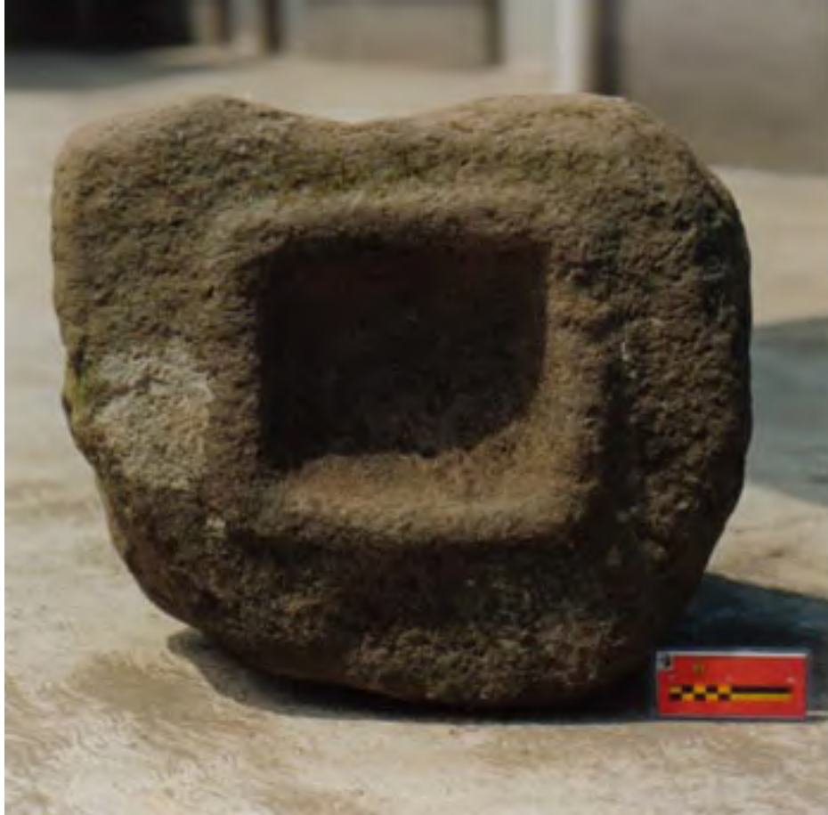
Figure 16. La Yerbabuena. Probable Olmec monument found on the surface 70 meters northwest of Pyramid 1.