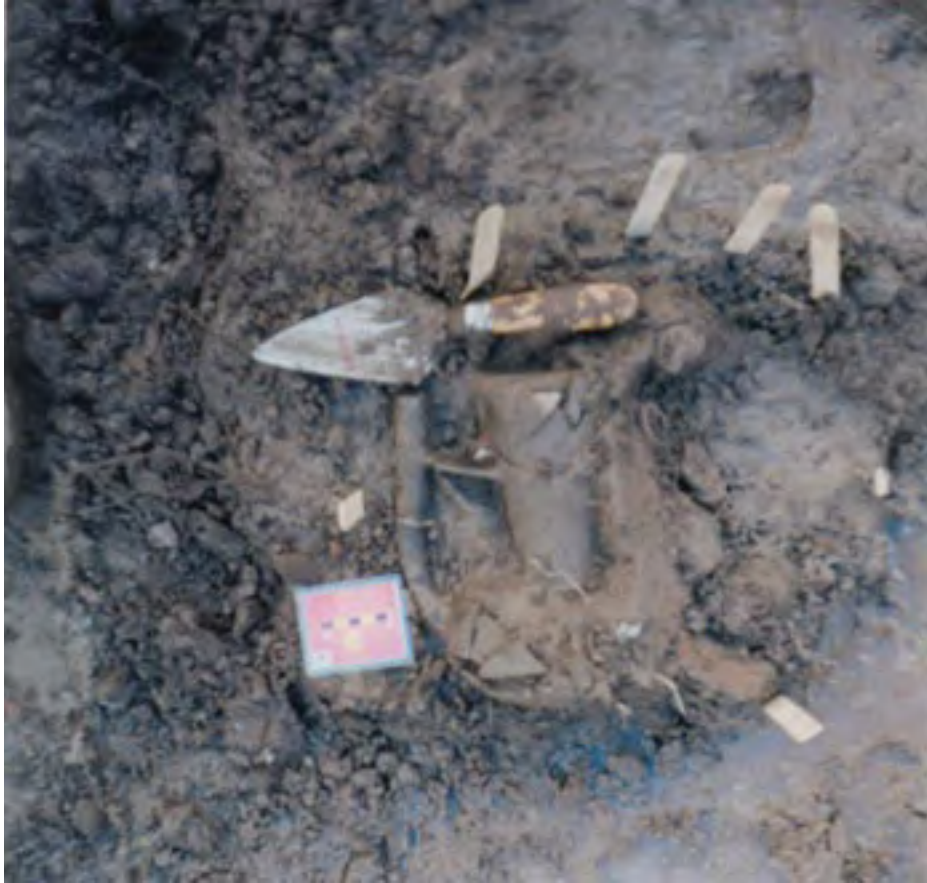
Figure 21. La Yerbabuena (Unit 53). Terminal Formative teapot-shaped vessel found in an offering above the floors of a Late Formative house.