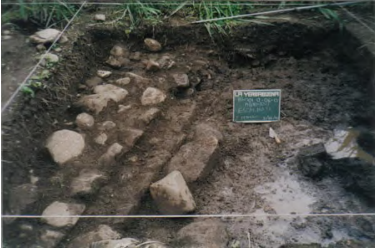
Figure 12. La Yerbabuena (Unit 80). Close-up of the excavation of the stairway shown in Figure 11.

The geophysicists at INAH's Subdirección de Apoyo Académico decided not to do radar or magnetic prospection at La Yerbabuena because the site possesses so many natural igneous rock formations (including basalts) that the monument fragments could not be detected. We have spent over a week probing the entire area of Unit 80 with crowbar-like sharpened wooden poles to a depth of 70 cm., but have not found the missing sculptured fragments. It probably will be necessary to dig trench-like excavations over much of Unit 80 in order to find these fragments, but the land owners want between $2,000-3,000 dollars for crop damages to do this. I will try to get money for this during our next field season.