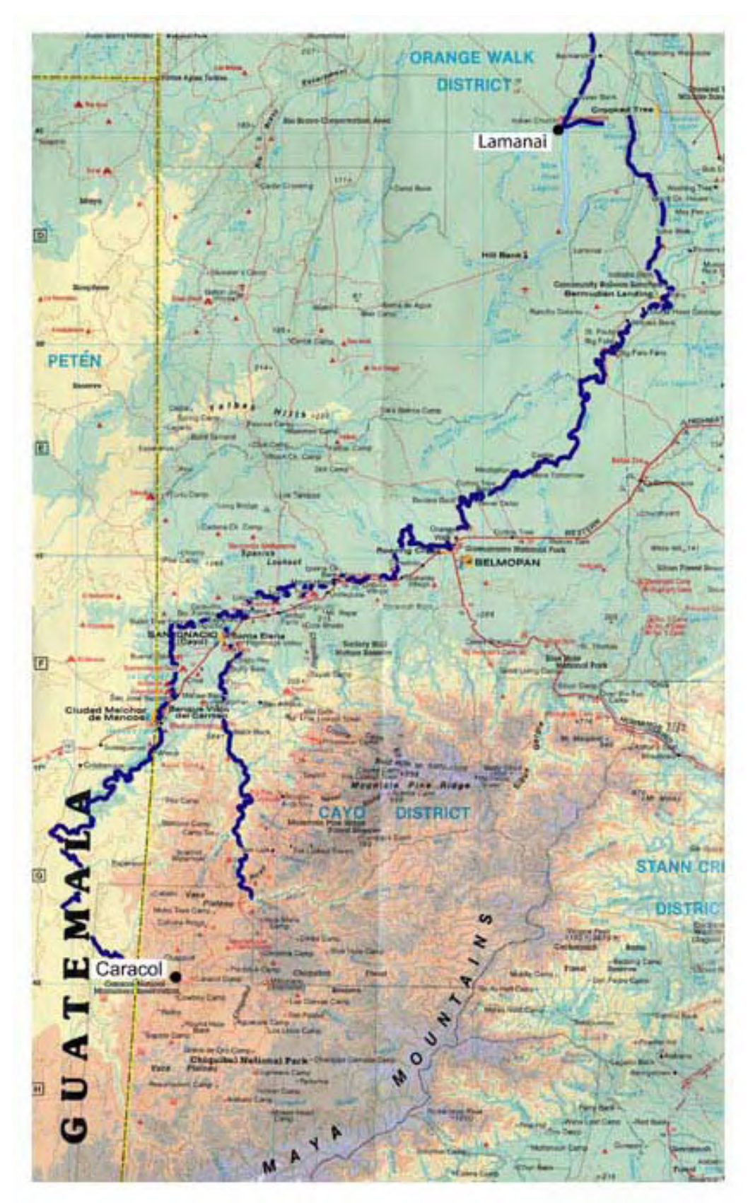
Figure 3. Map showing interlocking waterways.