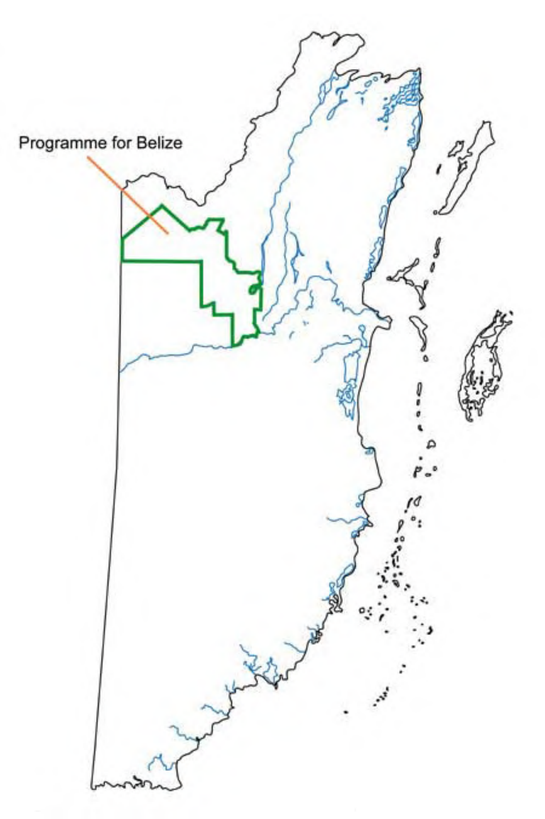
Figure 1. Programme for Belize Reserve (~260,000 acres).