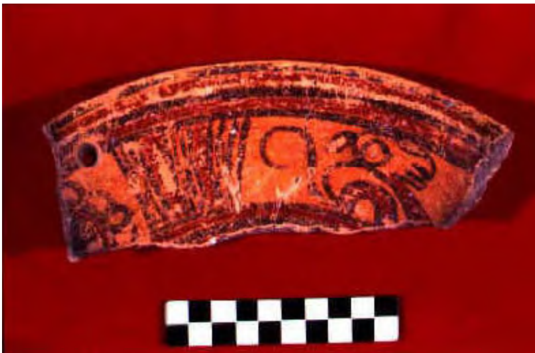
Figure 5. Palmar Orange-polychrome.

A 1998 reconnaissance of Saktunja revealed similar concentrations of house mounds, intensive salt production, and a wide array of artifacts typical of a residential community. Like Northern River Lagoon and other coastal transshipment sites, a disproportionate number of imported goods, in particular, ceramics typical of the Late Classic Early Postclassic transition, were in evidence ( Figure 5 , Figure 6 and Figure 7 ).