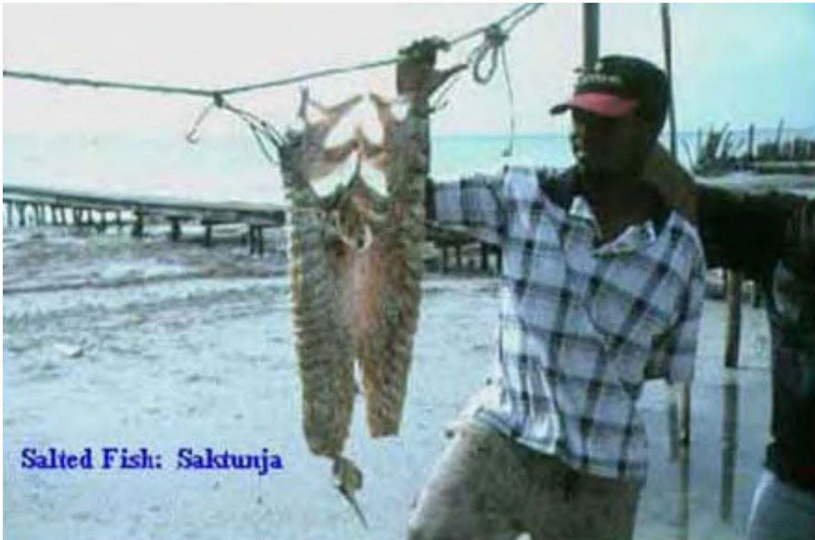
Figure 13. Salted Fish: Saktunja.

A number of Late Classic ceramic net sinkers of varying sizes found in the excavations support this contention. Presumably, many of the utilized chert bifaces recovered in Late to Terminal Classic deposits were also hafted and used as spears to catch fish in the more shallow lagoon waters.