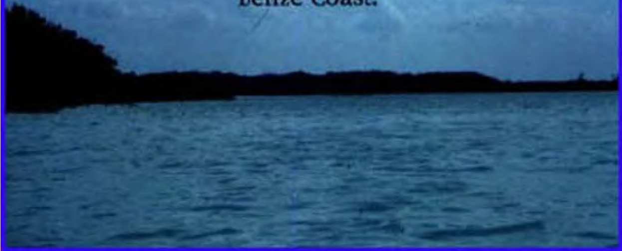
Figure 1. A View from the Lagoons.

Late Maya Classic - Postclassic Settlement on the Northern Belize Coast.