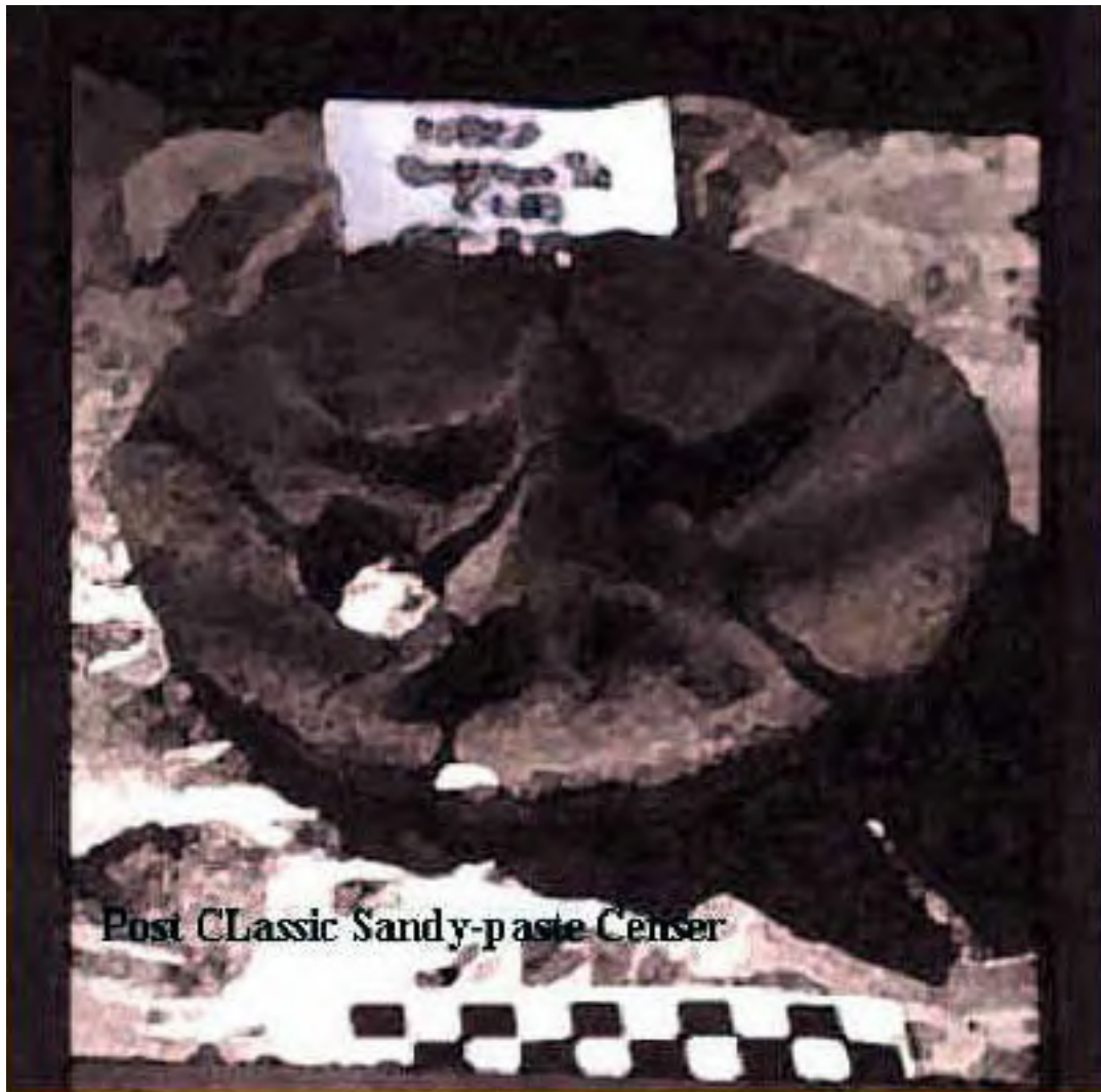
Figure 9. Post Classic Sandy-paste Censer.

feasting episodes, the deposition of censers, and artifacts imbued with water-related symbolism ( Figure 9 ).