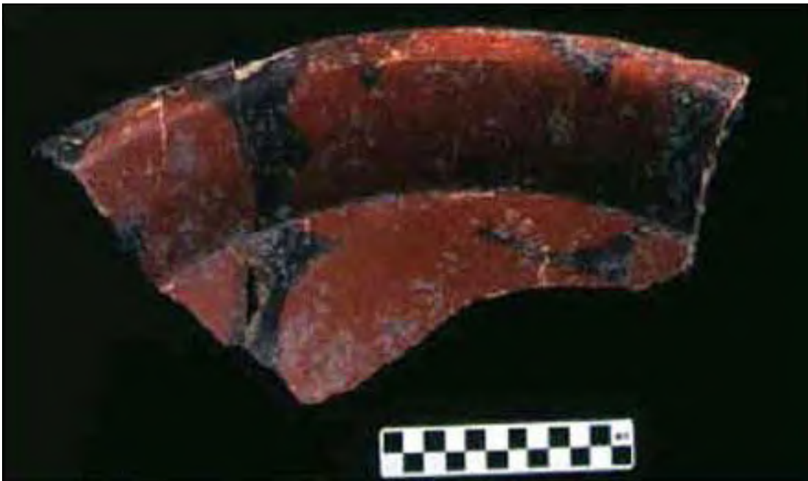
Figure 7. Daylight Orange: Dark Night Variety.

With FAMSI funding the staff initiated a rigorous program of field work and laboratory analysis at Saktunja in 1999. The primary goals of the project were to fine tune Maya Late Classic to Postclassic chronology (A.D. 680-1500) through the ceramics and lithics and to collect data pertinent to settlement configuration, specialized production, and intra-site hierarchies. An additional goal was compare and contrast this data to examine Saktunja's role within the larger configuration of coastal and inland sites in north central Belize (Mock 1994, 1997).