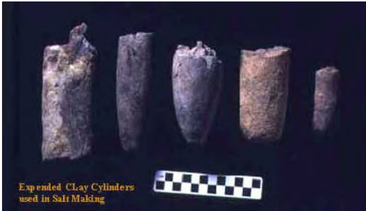
Figure 12. Expanded Clay Cylinders used in Salt Making.

Some of the typically broken and burned cylinders were found in situ, always-stuck upright in a marly matrix. We also found features suggesting the evaporation of seawater to produce concentrated brine prior to the boiling, thus maximizing what would be a labor and fuel intensive process. By necessity, salt making would have been a dry season activity in Belize, the salt molds if not distributed locally, stored for canoe transportation during the rainy season when the rivers were flowing. Importantly, ceramics associated with the salt making vessels and cylinders are typical of the Late to Terminal Classic, thus anchoring this specialized activity to this time period. Counts of potsherds associated with salt production are considerably lower in the Postclassic upper lots excavated at the site, supporting this conjecture.