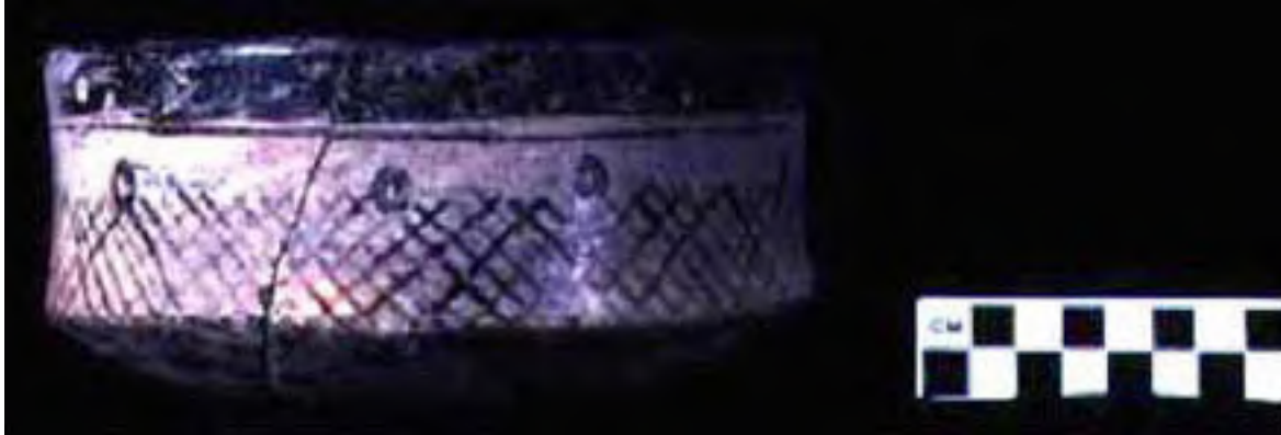
Figure 6. Zacatal Cream-polychrome.