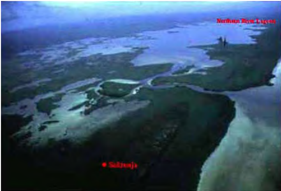
Figure 3. Aerial shot of Saktunja and Northern River Lagoon.