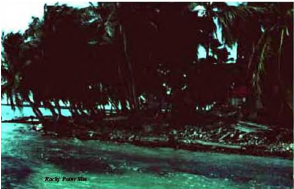
Figure 4. Rocky Point Landing site.