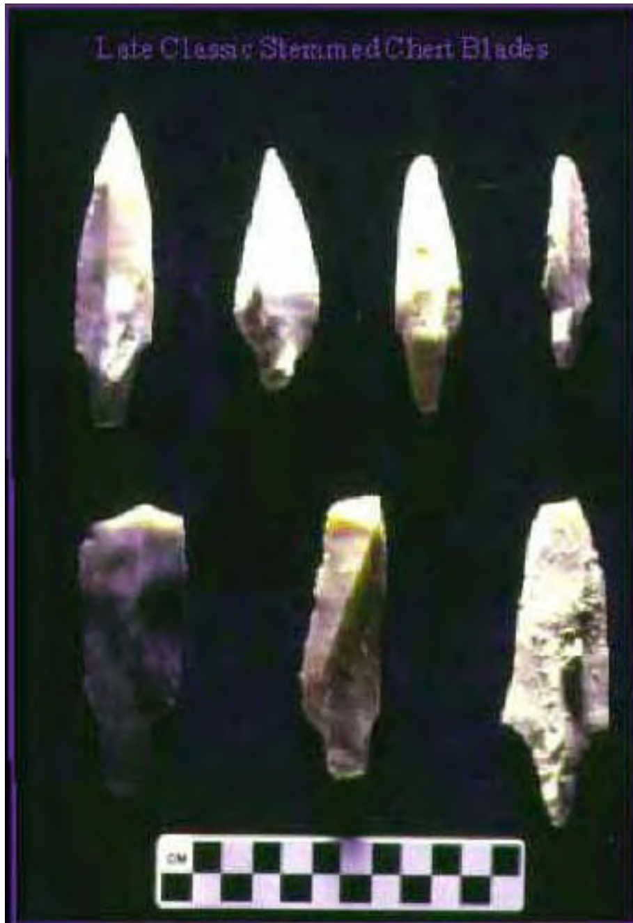
Figure 11. Late Classic Stemmed Chert Blades.

Large concentrations of crude, broken ceramics (thin walled bowls) and expended clay cylinders used to hold the salt boiling vessels and molds over the fire are in evidence on the surface and in Operations 1B, 3A, and 4A ( Figure 12 ).