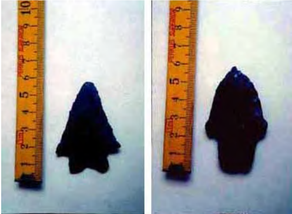
Plate 2. Two potentially Archaic Period projectiles from Sayula-Zacoalco Lake Basin. Private collection in Teocuicatlán.