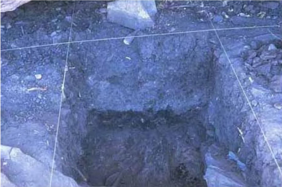
Plate 11. Photo of profile of east wall in Moreno 5 test pit. Archaic occupation was documented by an obsidian biface (see Plate 3) and an associated radiocarbon date of 5610-5450 B.P. (calibrated) located at interface of light and dark gray horizons at the center of the photograph.

the shore of the lake for a distance of approximately 2 kilometers to the west. The rockshelter extends back from the mouth approximately 6 to 8 meters north-northeast. The datum and grid baseline extended into the rockshelter although test excavation was confined to an area at the shelter's mouth. This rockshelter's apron is littered with leaves, loose angular rocks and animal dung. The sediment deposited inside the shelter and the apron is very fine-grained dark gray sandy clay with large angular rocks that have fallen from the overlying basalt that make up the shelter's overhang.