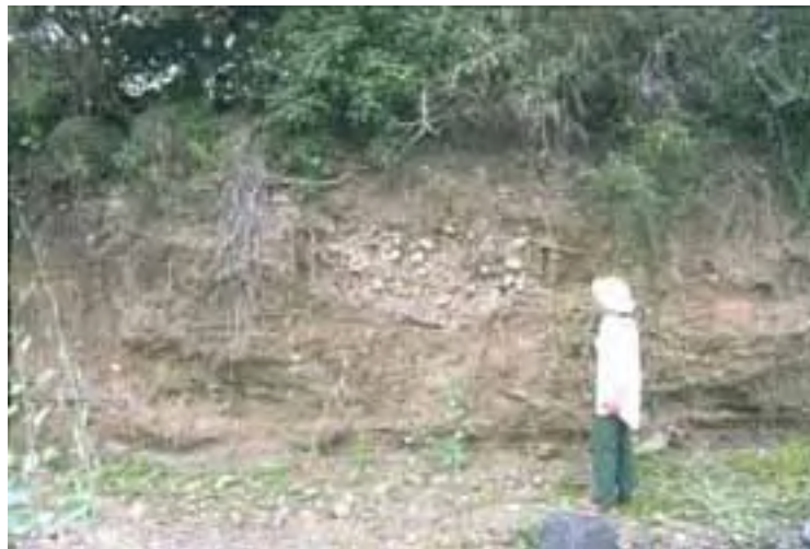
Plate 4a. Open sites encountered in profile in arroyo de Jasmín. Cultural feature exposed is Usmajac (Formative) Phase oven associated with prehistoric ground surface approximately 1 meter below the present ground surface. (Photos by Marcus Winter).

in areas where continuous occupation could have produced evidence of prior and subsequent occupations, such as the Paleo-Indian localities already mentioned, as well as sites demonstrating evidence of Late Formative occupation (circa 2300 – 1700 B.P.) which was, until recently, the earliest phase of occupation recognized in the Sayula Basin. One of the open sites we located contains contextual evidence of Capacha Phase occupation, which is the earliest ceramic-bearing agricultural phase known in western México. Some archaeologists believed Capacha to be contemporaneous with the earliest sedentary agricultural groups from southeastern México (Kelly, 1986; Mountjoy, 1999). Surface indications of Preceramic occupation were not encountered at any of the shelters. Test excavation was undertaken at three rockshelters containing Formative (Usmajac/Verdia Phase), Classic (Sayula Phase/Cojamatlán) and Postclassic (Amacueca Phase) evidence of occupation (Valdez et al. , 1996; Ramirez et al. , 1996).