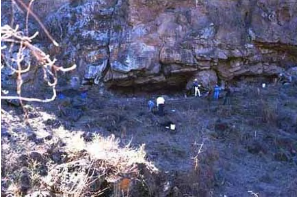
Plate 8. Moreno 3 shelter from the south. Alternate squares were excavated from inside the shelter 6.5 meters down the talus slope. Slope below shelter mouth is coamíl in barbecho. The greatest quantity of cultural material was recovered in the test pit 6 meters below shelter mouth.