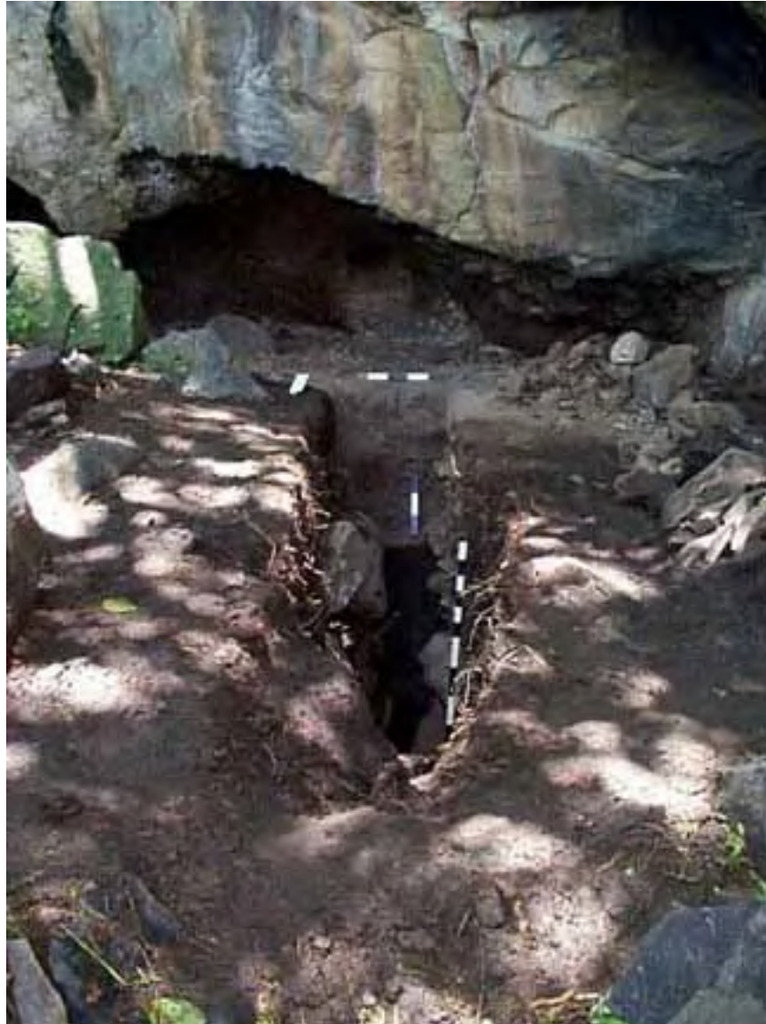
Plate 7. Test trench at mouth of Atotonilco shelter before backfilling. Stadia rod at right is one meter tall. Rock fall made excavation extremely difficult and forced us to terminate excavation at slightly below one meter below datum. Black at bottom of trench is plastic covering left to delineate limits of test excavation.