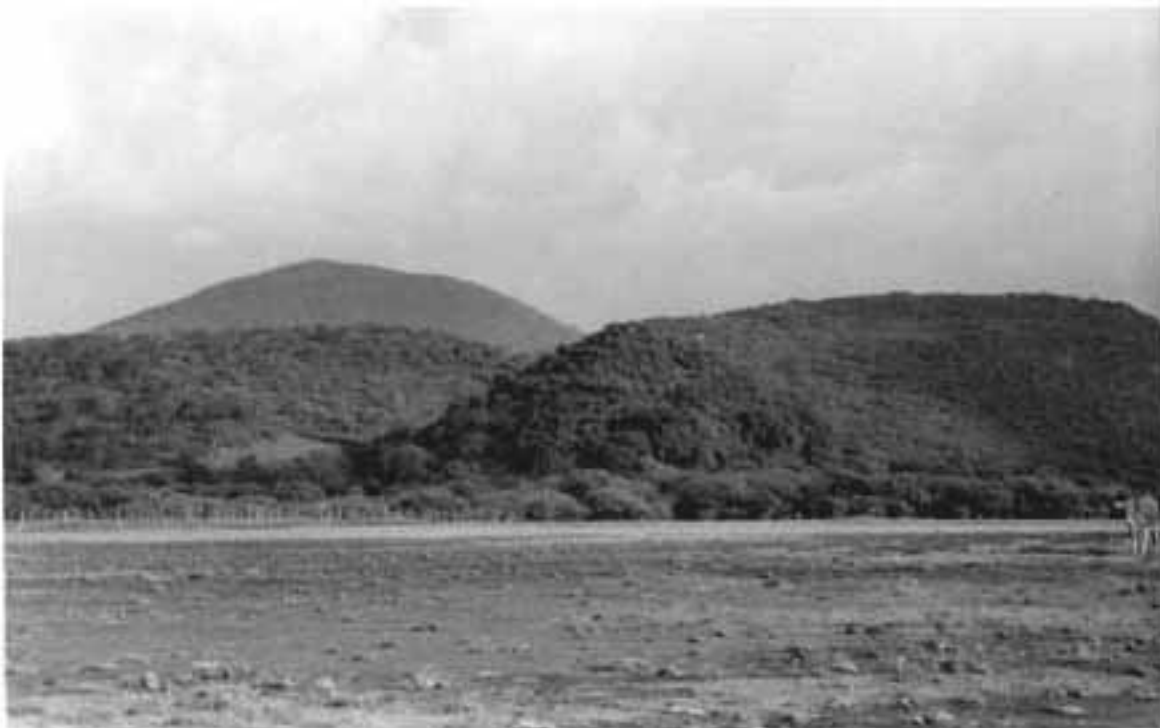
Plate 6. Cerro Atotonilco from the northwest. Shelter that was tested is located above the fence line in the center left of the photo. This cerro is located at the point where the Sayula Lake Basin adjoins the Teocuitatlán valley.