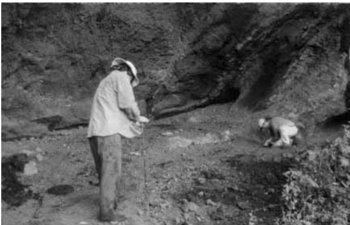
Plate 5. POAM personnel making trowel and auger tests in shallow deposits in Abrigo El Romerio (CS-A33). (Photo by Marcus Winter).

All rockshelters that contained accumulated surface sediment that overlaid the shelter's bedrock floor were trowel tested, and when possible, auger tested, to determine the depth of the sediments ( Plate 5 ). In many, in fact the majority, of shelters, these surface sediments were too shallow to harbor significant cultural deposits. Collections were made of all diagnostic artifacts occurring on the surface in all rockshelters.