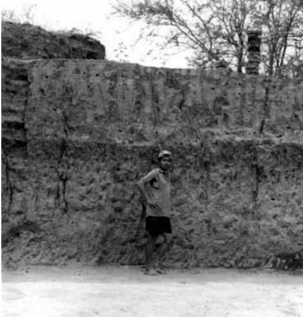
Plate 4b. Open sites encountered in profile in Sayula brick manufacturing borrow pit. House floor exposed in profile as light gray horizontal line above head of individual contained abundant ceramic sherds and obsidian projectiles characteristic of Sayula Phase (Classic Period).

We conducted pedestrian survey of the beaches, piedmont and alluvium in areas where rockshelters and surface finds had been reported ( Plate 4a & Plate 4b ). We talked with local landowners, looters and local authorities, which provided directions to locate rockshelters and open sites that might contain evidence of the Preceramic Period. We also revisited sites where Formative, Classic, and Postclassic Period occupations had been identified. In addition to the assistance we obtained from local people and from previous archaeological work, our survey focused on areas of the lake basins that had ready access to the lakes and lakeshores, water, alluvium for agricultural pursuits and areas located in close proximity to forested slopes for hunting and gathering. Rockshelters and open sites, as well as localities in the vicinity of cities and pueblos that showed potential were located using a GPS and coordinates were recorded for mapping