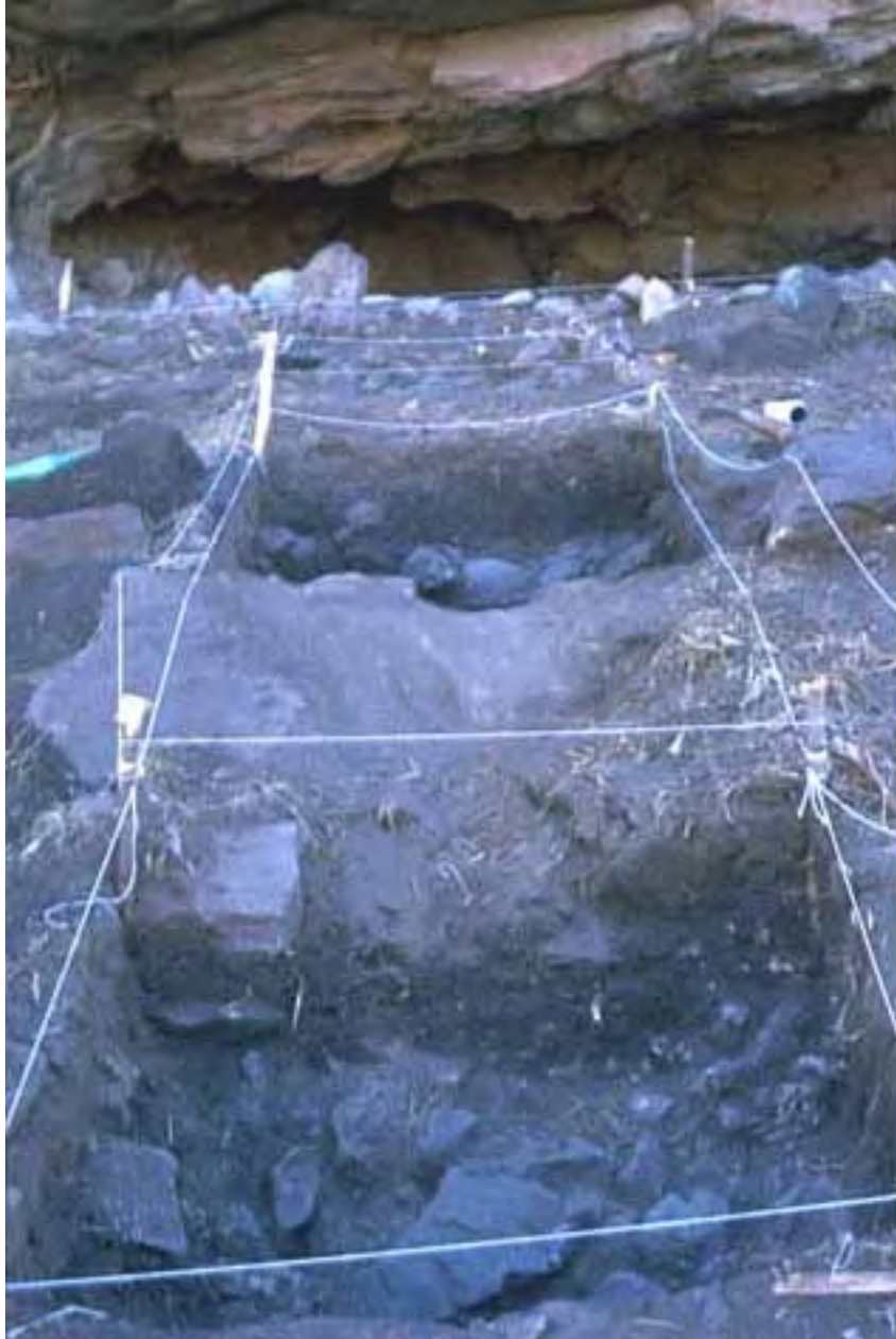
Plate 9. Test (1 square) pits on talus below shelter mouth at Moreno 3. Talus is composed of large and small rocks. Follow-up excavation will remove rocks to ensure excavation proceeds to bedrock. (Photo by Bruce Benz).