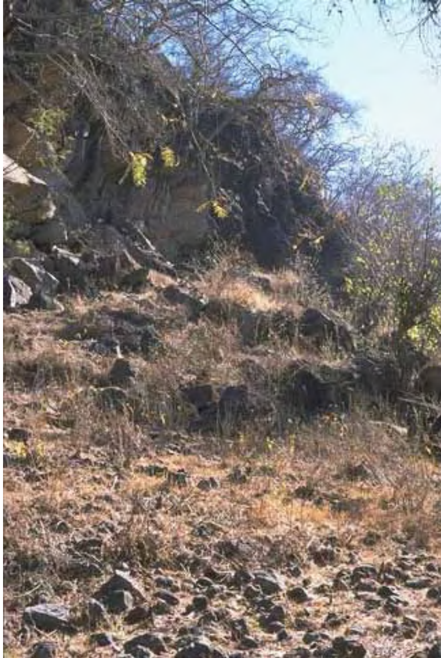
Plate 10. Moreno 5 is the one rockshelter in the Sayula-Zacoalco basin that has produced evidence of Archaic occupation. The shelter faces west and is located beneath rock face at center of photo and above accumulation of boulders forming apron in front of the shelter's mouth.

All test excavation proceeded by arbitrary levels until natural or cultural stratigraphy could be recognized. Features of cultural activity were excavated separately. Organic material found in relevant datable contexts was mapped according to the established site datum. Sediment samples from excavation levels were retained after screening for future analysis.